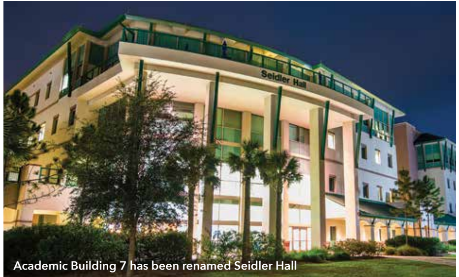
Academic Building 7 has been renamed Seidler Hall