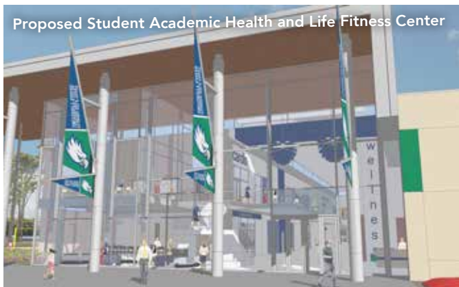
Proposed Student Academic Health and Life Fitness Center