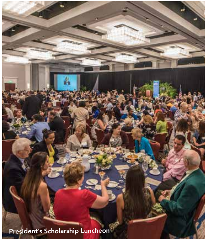
President's Scholarship Luncheon

Public Media's "Fund Our Future" campaign has raised $9 million toward a goal of $30 million. Athletics raised more than $1.8 million to expand Alico Arena and saw significant growth in Eagles Club, with a 15 percent increase in revenue that directly supports the University's athletes and coaches.