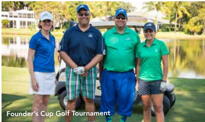
Founder's Cup Golf Tournament