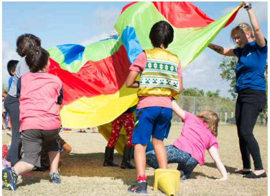
FGCU students and faculty visit Everglades City School for games, an ice cream social, and time for the students to talk about life post-Irma.

"We believe in this community and we want to