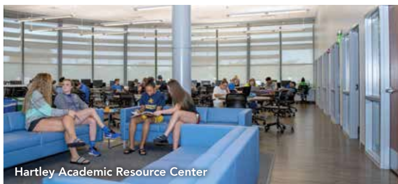
Hartley Academic Resource Center

will offer expanded learning opportunities to all student-athletes at this first-class institution of higher learning, and we're excited and proud to be able to support it."