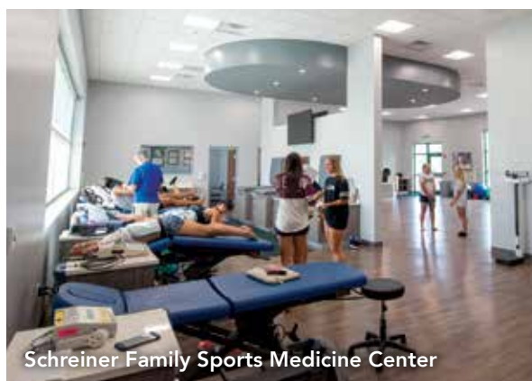
Schreiner Family Sports Medicine Center